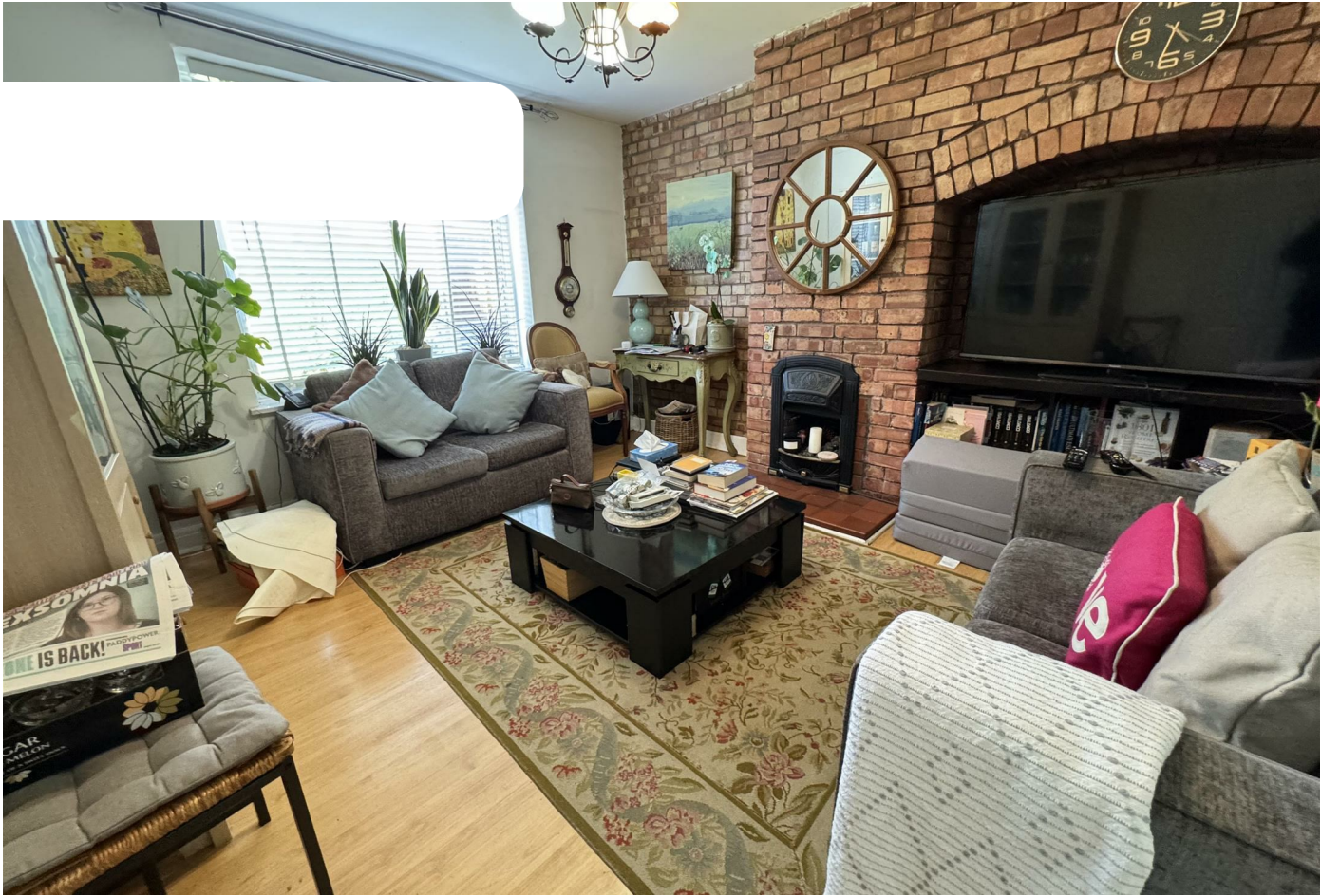
House - Terraced